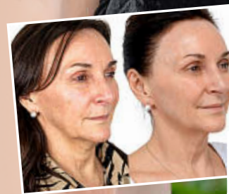
RESULTS Shirley before and after the treatment